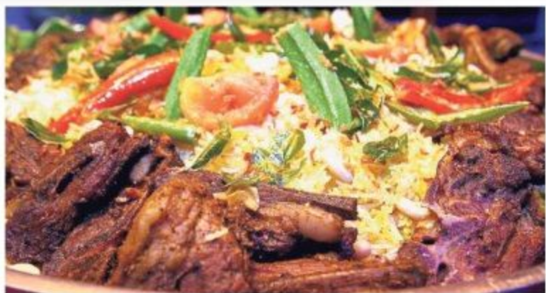
The aromatic lamb briyani.

Quench your thirst with fresh coconut juice and then head to the ais kacang bar for dessert.