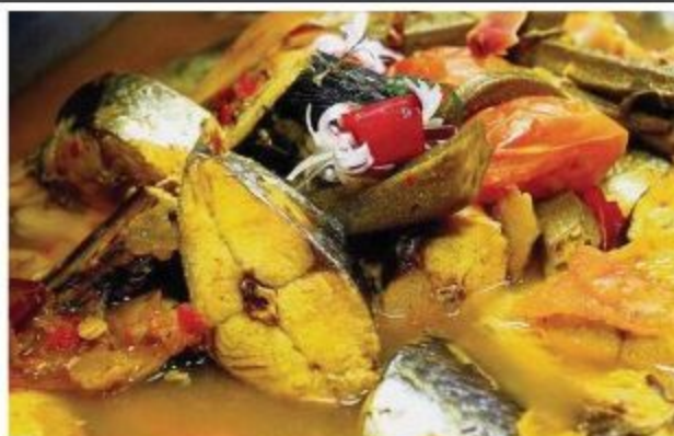
Mackerel pindang from Palembang, Sumatra.