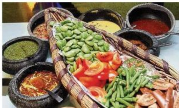
Plump, bright, green petai seeds with an assortment of relishes.