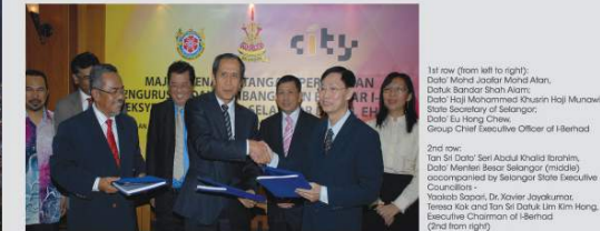
i-City Management and Development Agreement A Catalyst for Growth

The agreement documenting i-City as an integrated Technopreneur Campus and Tourism Destination 1) Formalises the International Park policies set forth since 2006 by the Selangor State Government. The International Park status is to further enhance i-City as a MSC Malaysia Cybercentric and Tourism Destination endorsement by the Federal Government. 2) Positions i-City as a catalyst in making the capital city of Selangor a preferred hub for both the international and domestic knowledge and tourism industry where the Bumpitara quota aside, investment and development policies would be similar to those of Cyberjaya. 3) Enables i-City to be managed as a gated and guarded zone as well as a night tourism spot with 24 hour operations. It also grants i-City a Temporary Occupation License (TOL) for 30 acres of neighbouring land for beautification works. i-City is envisioned to transform Section 7 of the capital city into a vibrant commercial and tourism hub. 4) Requires i-City to undertake a number of socio-economic programmes that will benefit the community at large, especially the Rakyat of Selangor such as establishing a technopreneur incubator, providing high speed broadband and using green building and energy savings index for its development.